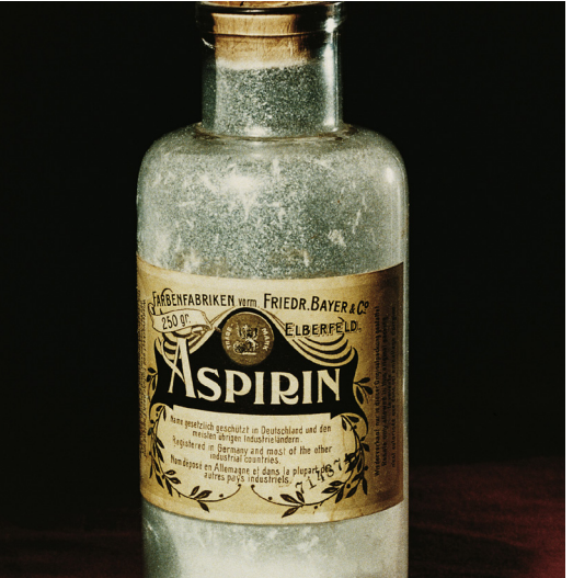
USED UNDER LICENSE FROM BAYER